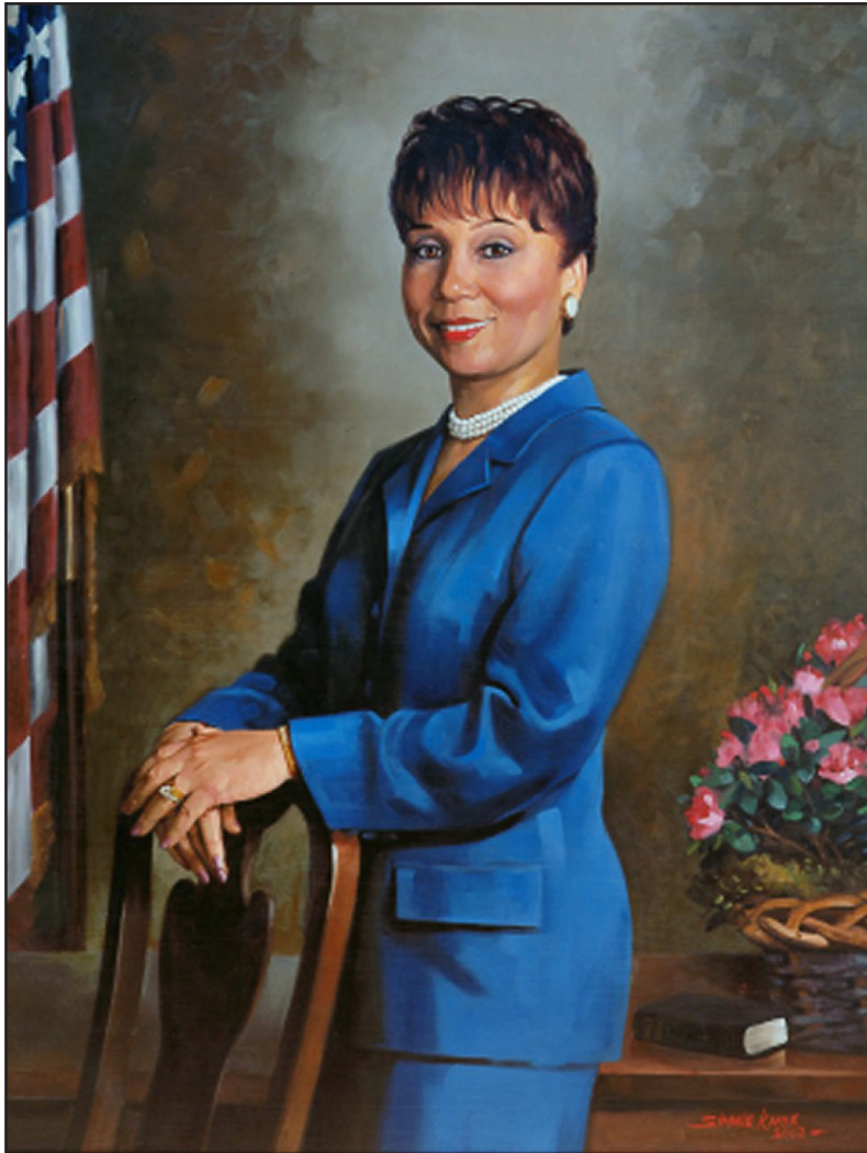
UNITED STATES SECRETARY OF LABOR 1997–2001