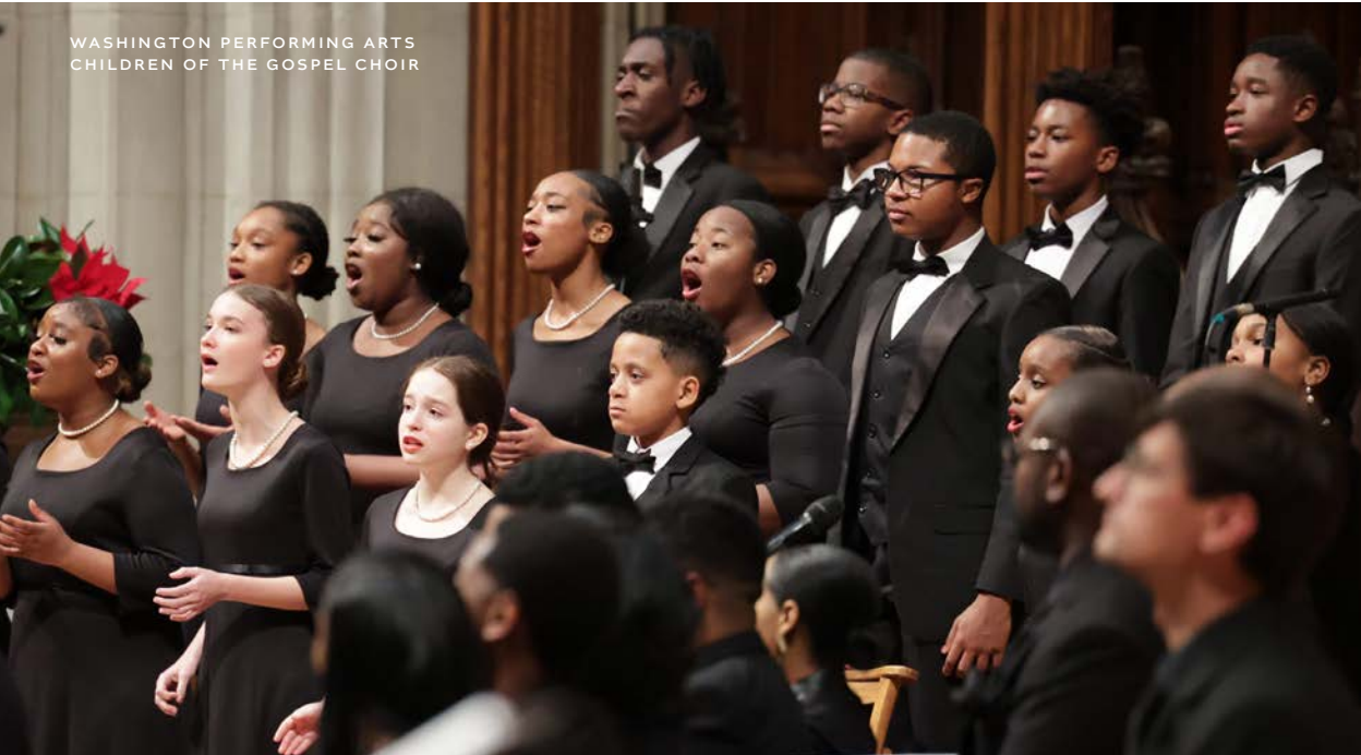
WASHINGTON PERFORMING ARTS CHILDREN OF THE GOSPEL CHOIR