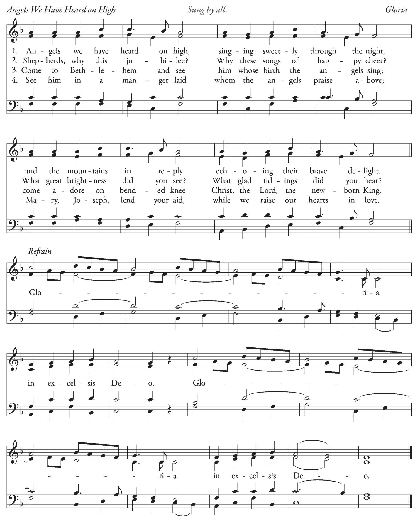
The people are seated.