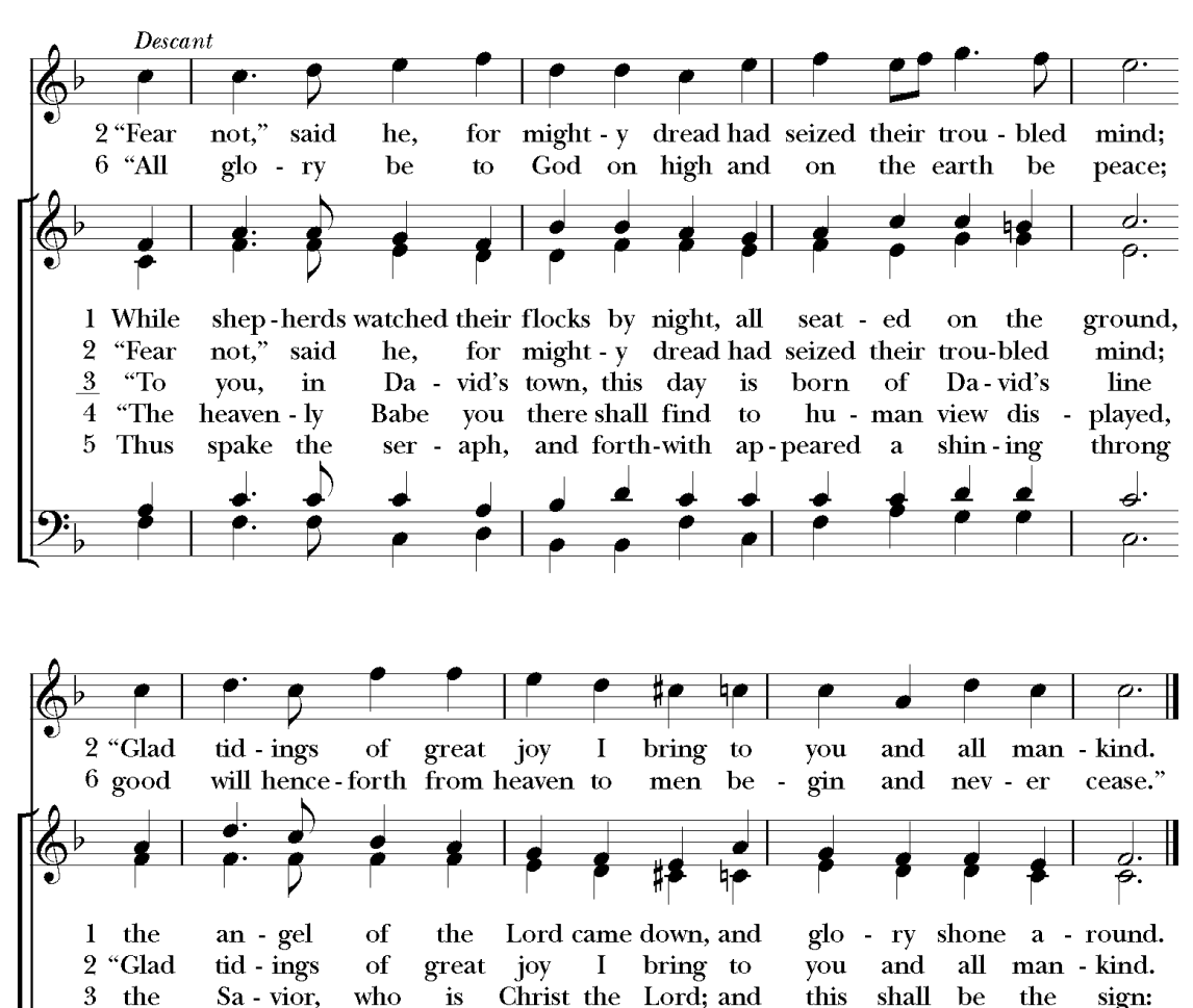
6 "All glory be to God on high and on the earth be peace; good will henceforth from heaven to men begin and never cease."